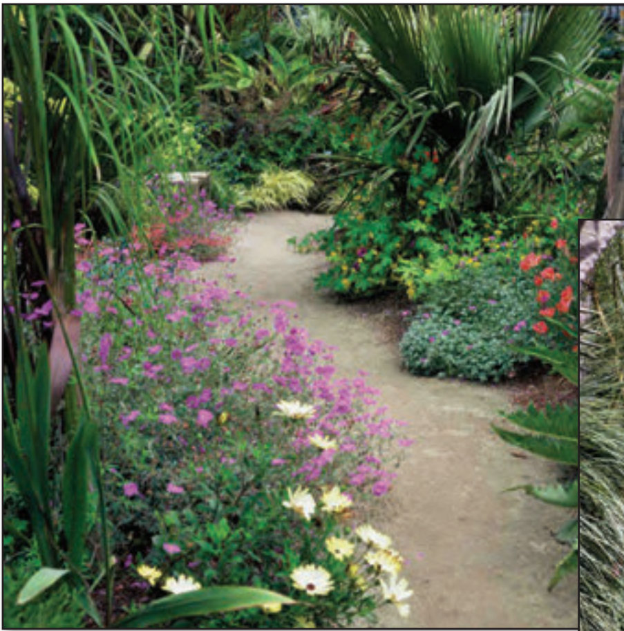
Detail of plantings on the interior path of the sunny border.