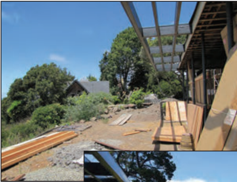
Before: lawn looking northwest.