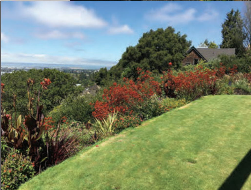
Below - After: Looking south, the low, tough, drought and wind tolerant plantings surround the bent-grass lawn, the full expanse of the view reaches the home.