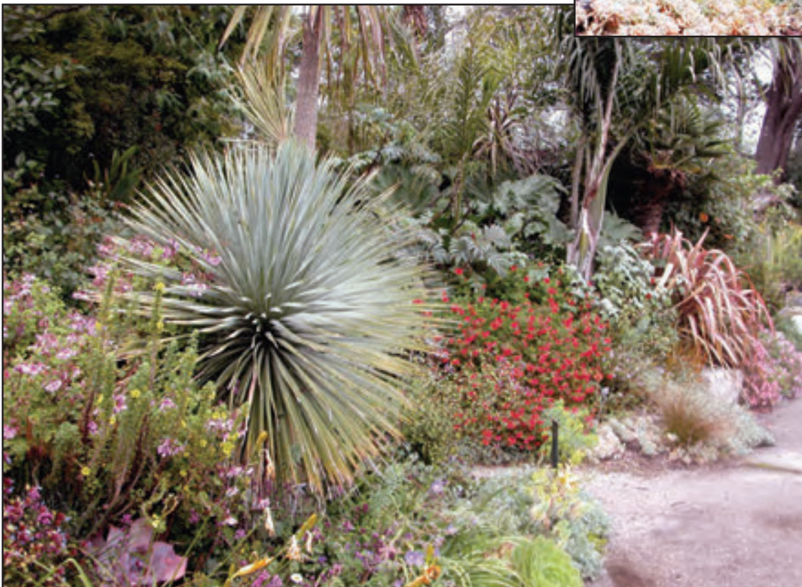
Sunny Entry Border shows an intricate mix of spectacular plants that could grow in much of the Bay Area.