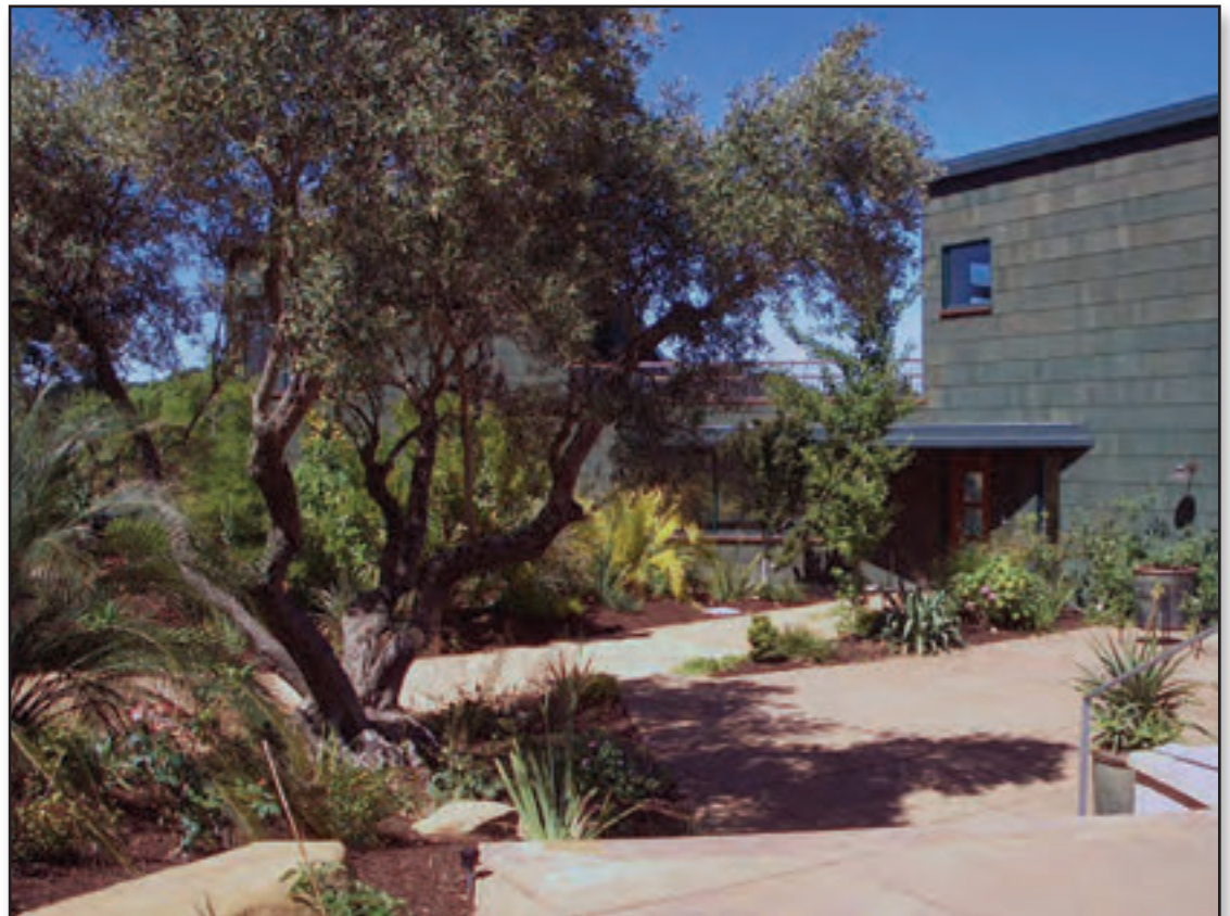
Entry court after planting. The large areas of pavement are now in scale with the plantings and welcome visitors.