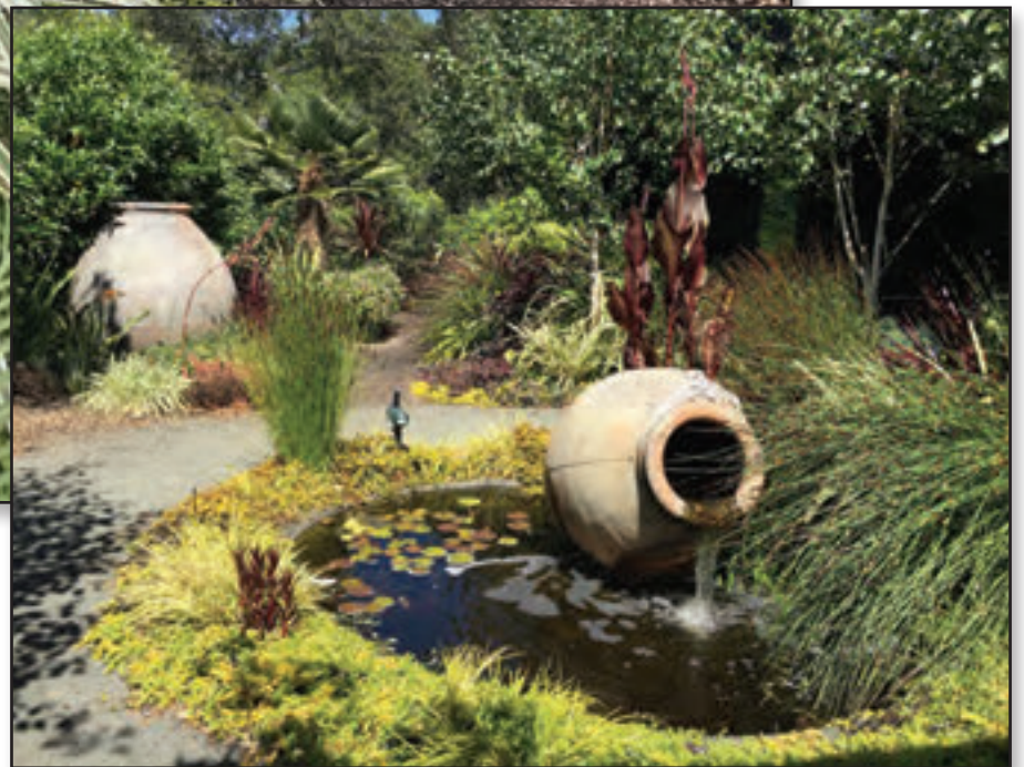
Other garden views reflecting scale of home and landscape.