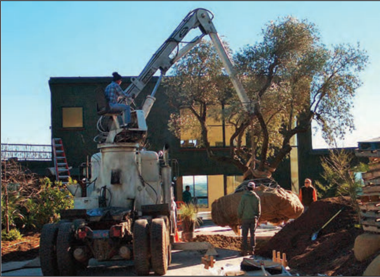
Huge specimen olive tree placed into entry court of the new home.