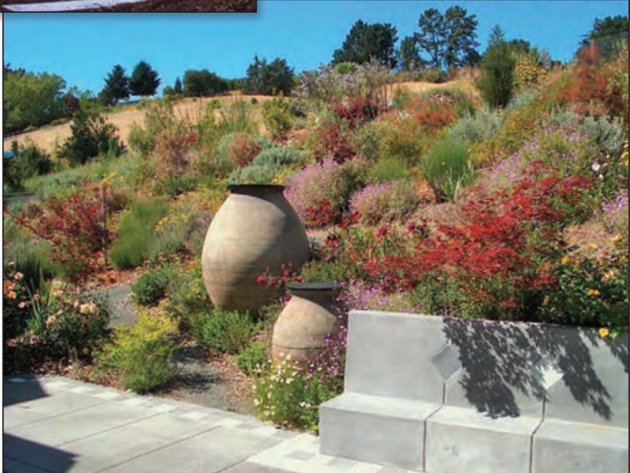
Dining terrace looking up to the Mediterranean hill plantings.